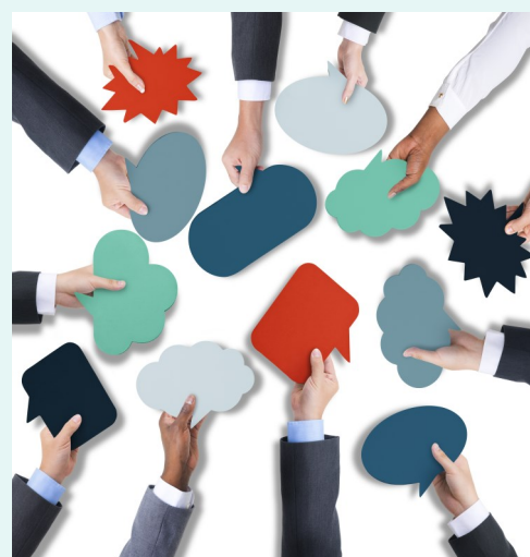
Image 4. The stakeholder workshop on the ICH E6 R3 public consultation will take place on 13-14 July 2023.

Further details on the workshop, including on the registration process and agendas, will be published on dedicated event page . Early registration is recommended to facilitate the planning and allocation of the breakout sessions especially.