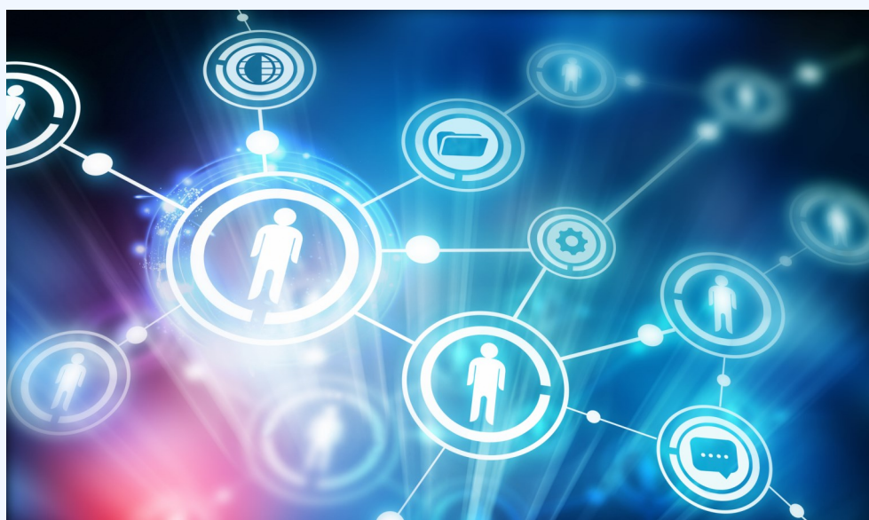
Image 3. The kick-off meeting of the Multi-stakeholder platform will take place on 22-23 June 2023.

Further details on the multi-stakeholder platform meeting will be published on the dedicated event page .